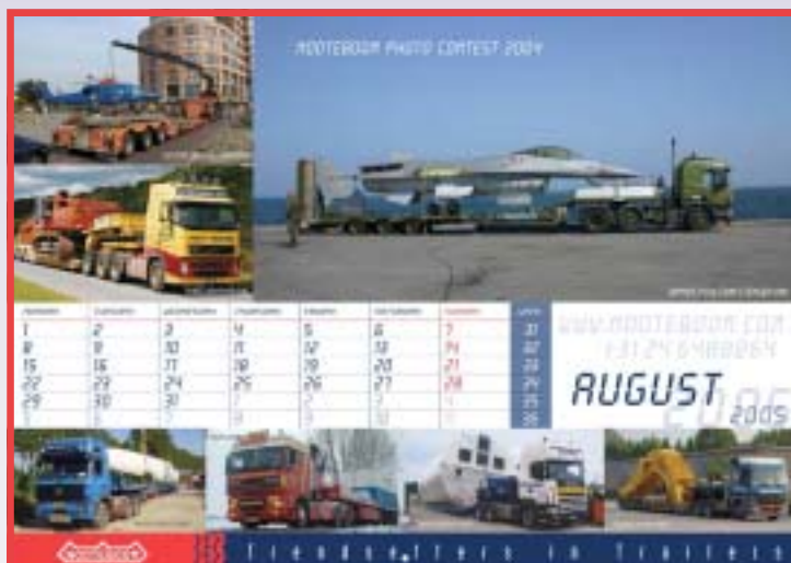
Photo competition 2005 In view of the enormous popularity of the 2004 photo competition, it is to be continued in 2005. From now on you can send in your photographs and each month we will choose one entry for the 'Photo of the Year' competition. Closing date is 1 October 2005. The competition rules, prices and photo tips are identical to those published in the Shop Newsletter 'summer 2004'.

Please send your photo's to: Nootboom Trailers